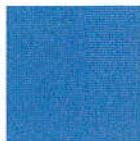
TRAVIS BRISENO Dentist