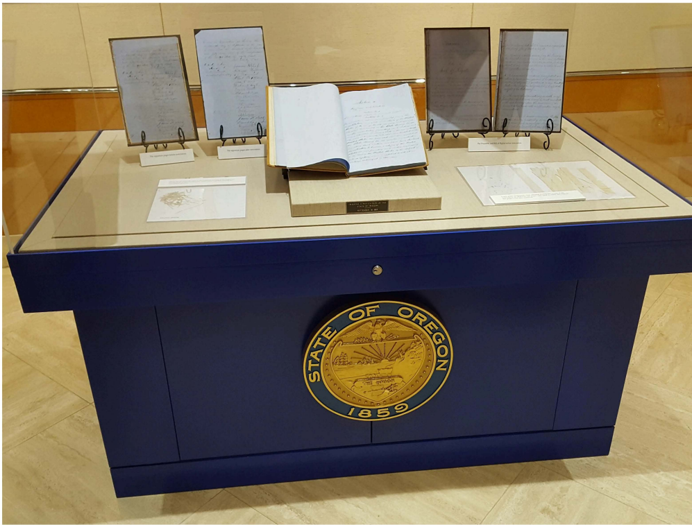
The Oregon State Constitution rests in a case at the Oregon State Archives.