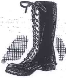
PACS & BOOTEES, 10 inches or higher. All laced rubber footwear of this height, and bootie types with or with- out laces. (Type 5)