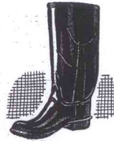
BELOW-KNEE- HEIGHT LIGHT BOOTS. (Type 4)