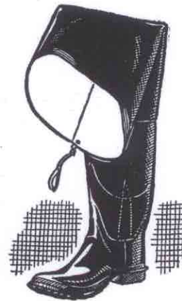
HIP-HEIGHT BOOTS. All hip, body, thigh, or sport- ing boots. (Type 1)