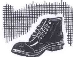
PACS, BOOTEES, AND WORK SHOES, less than 10 inches high. (Type 6)