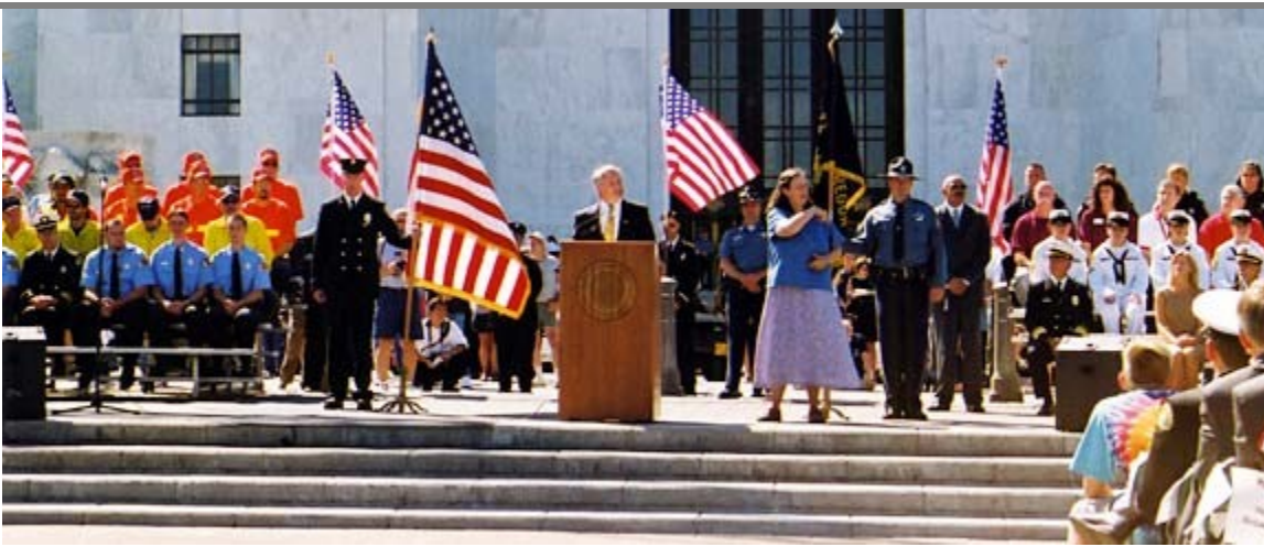
Governor John Kitzhaber at State Capitol

Governor John Kitzhaber addresses a ceremony at the State Capitol to commemorate the 1st anniversary of the Sept. 11, 2001 terrorist attacks. (Governor John A. Kitzhaber Records, September 11 Terrorist Attack Anniversary Ceremony Records)