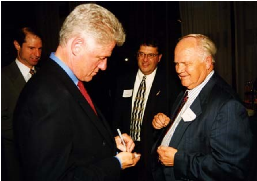
President Bill Clinton Autograph