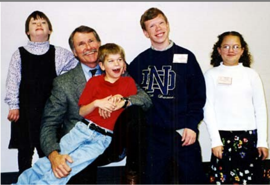
Students and Governor

Governor John Kitzhaber poses with childhood special education students in circa 1997.