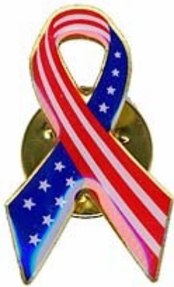
Lapel Pin First Anniversary of Sept. 11