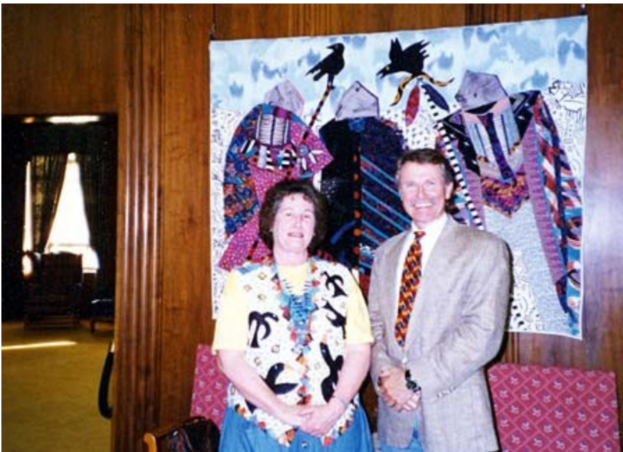
Quilt part of the "Art in the Governor's Office Program."

President Bill Clinton poses with Oregon U.S. Rep. Darleen Hooley of the 5th District (right) and an unidentified woman during a 1998 campaign dinner with Democratic Party supporters.