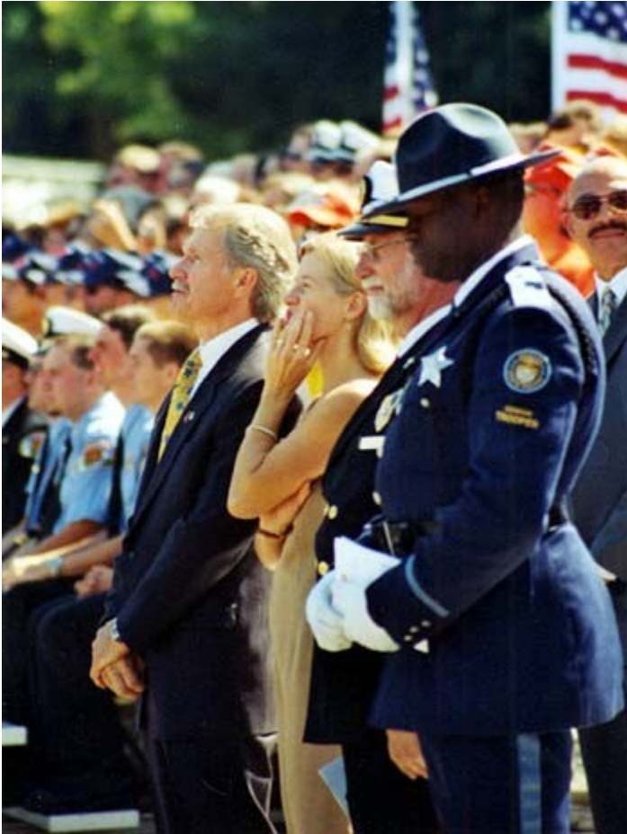
John and Sharon Kitzhaber Observe Ceremony

Gov. John Kitzhaber and Sharon Kitzhaber observe a ceremony at the State Capitol to commemorate the 1st anniversary of the Sept. 11, 2001 terrorist attacks. (Governor John A. Kitzhaber Records, September 11 Terrorist Attack Anniversary Ceremony Records)