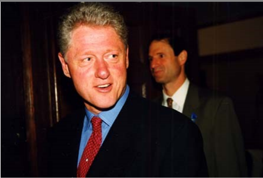
President Bill Clinton 1998

President Bill Clinton attends a 1998 campaign dinner with Democratic Party supporters. Oregon U.S. Senator Ron Wyden is in the background.