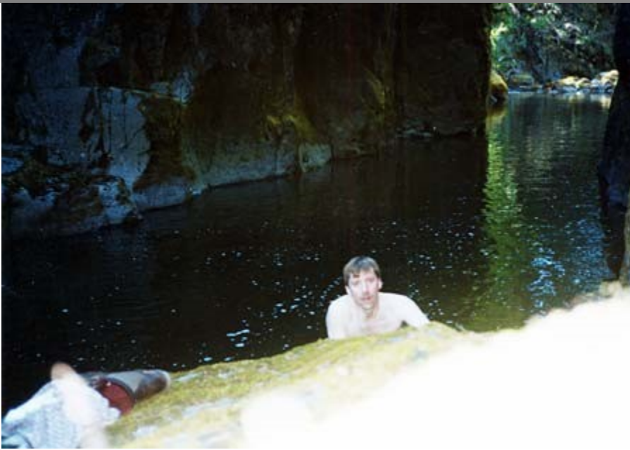
A researcher takes a break for a swim in a section of the North Umpqua River. The river was studied in relation to relicensing PacifiCorp's Hydroelectric Project