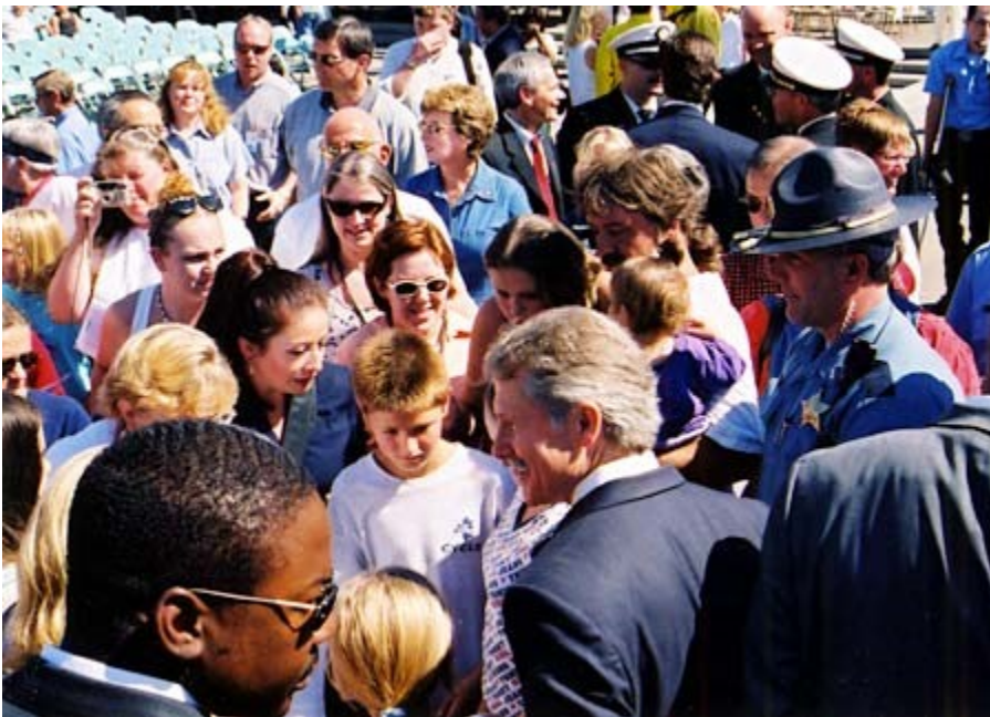
Governor John Kitzhaber Meets Public

Governor John Kitzhaber poses with childhood special education students in circa 1997. (Governor John A. Kitzhaber Records, Regional Workforce Quality Committees Records)