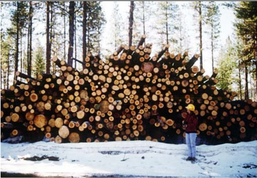
Salvaged Logs from 1996 Summit Fire

Salvaged logs from the 1996 Summit Fire site in the Malheur National Forest.