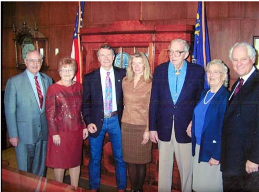
Five Oregon Governors