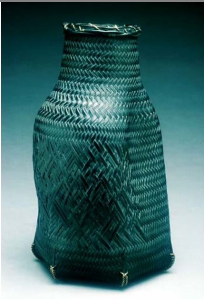
Basket of the "Art in the Governor's Office Program"