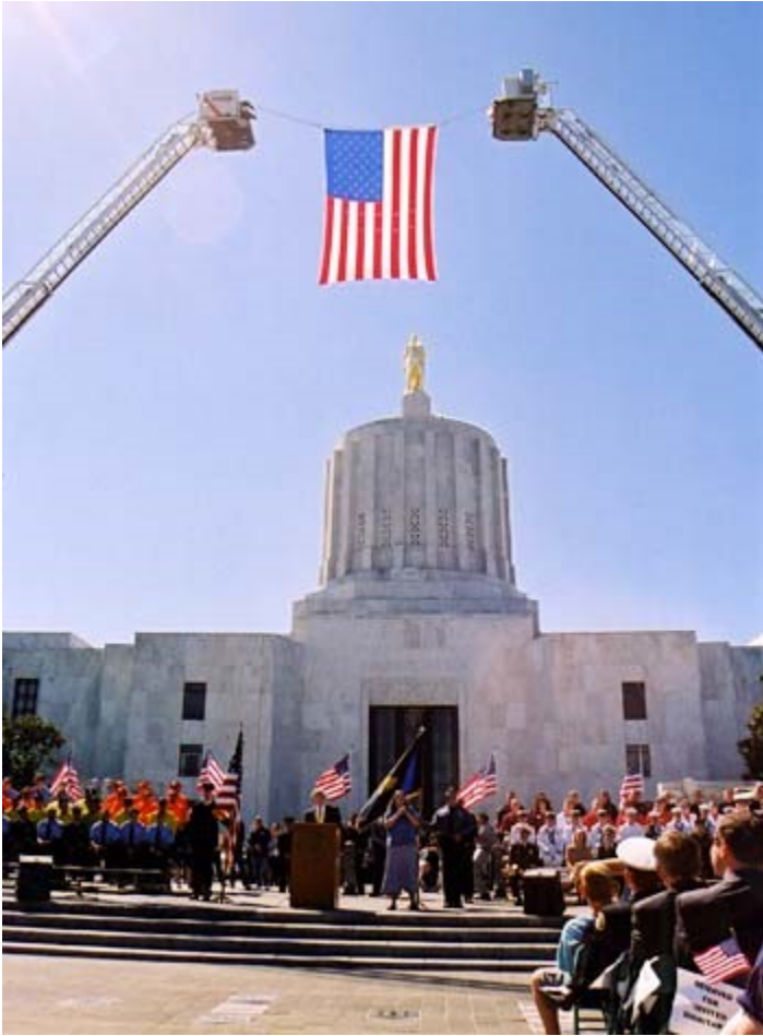
Flag Raised Over State Capitol

A flag is raised over Governor John Kitzhaber at a ceremony at the State Capitol to commemorate the 1st anniversary of the Sept. 11, 2001 terrorist attacks.