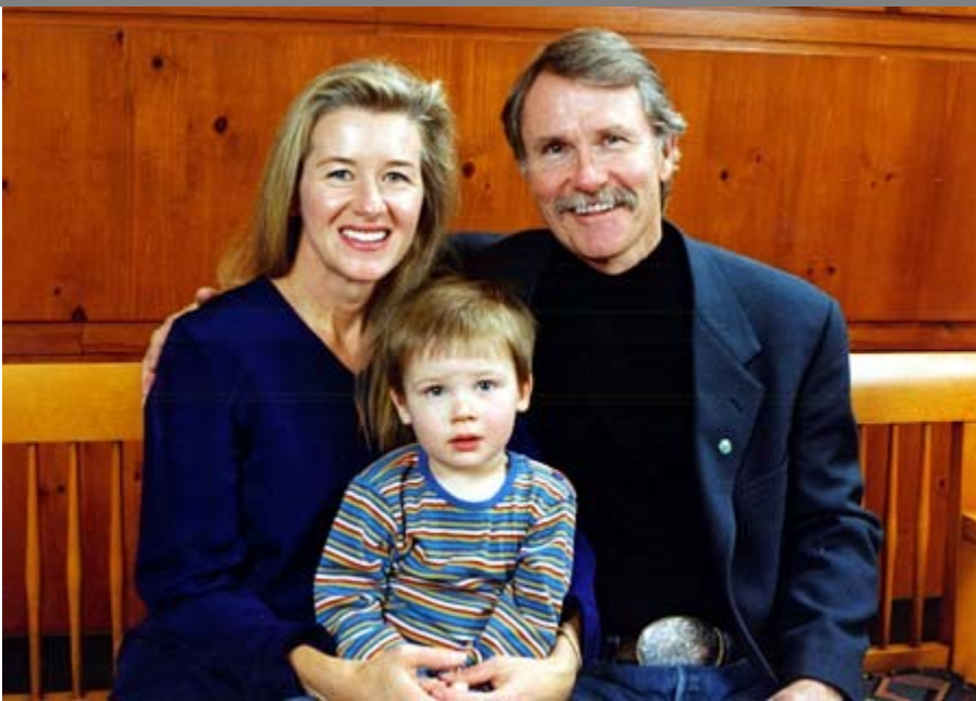
Oregon's First Family