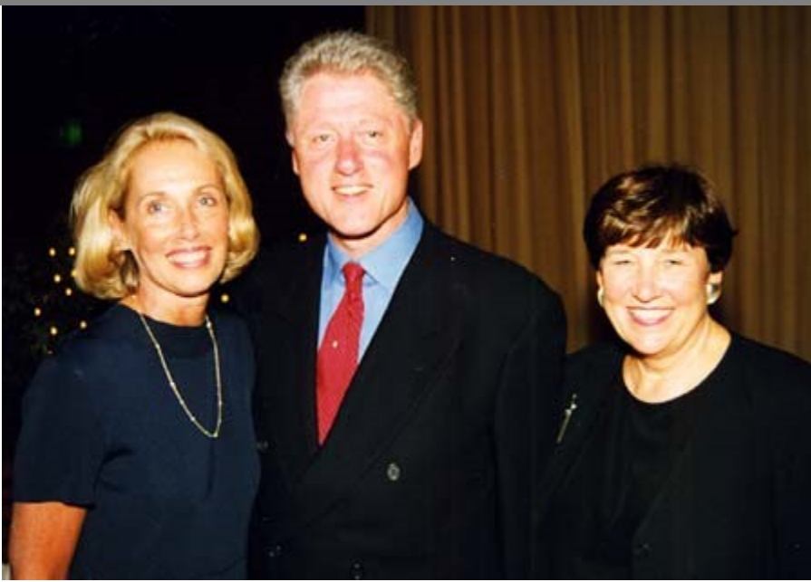
President Bill Clinton and Representative Darleen Hooley

President Bill Clinton poses with Oregon U.S. Rep. Darleen Hooley of the 5th District (right) and an unidentified woman during a 1998 campaign dinner with Democratic Party supporters. (Governor John A. Kitzhaber Records, Photographs and Negatives)