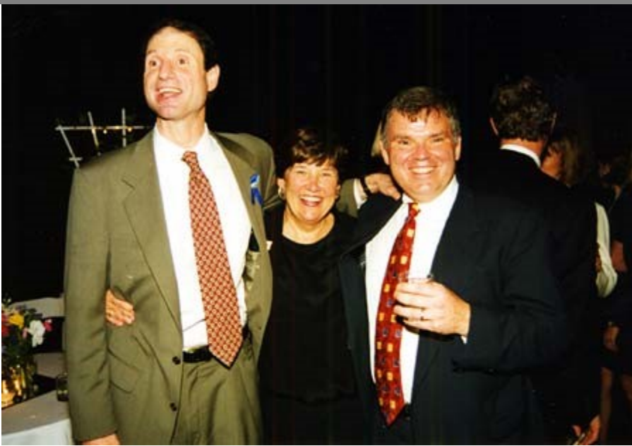
U.S. Senator Ron Wyden and U.S. Representative Darleen Hooley

Oregon U.S. Senator Ron Wyden attends a 1998 campaign dinner with Democratic Party supporters, including Oregon U.S. Representative Darleen Hooley.