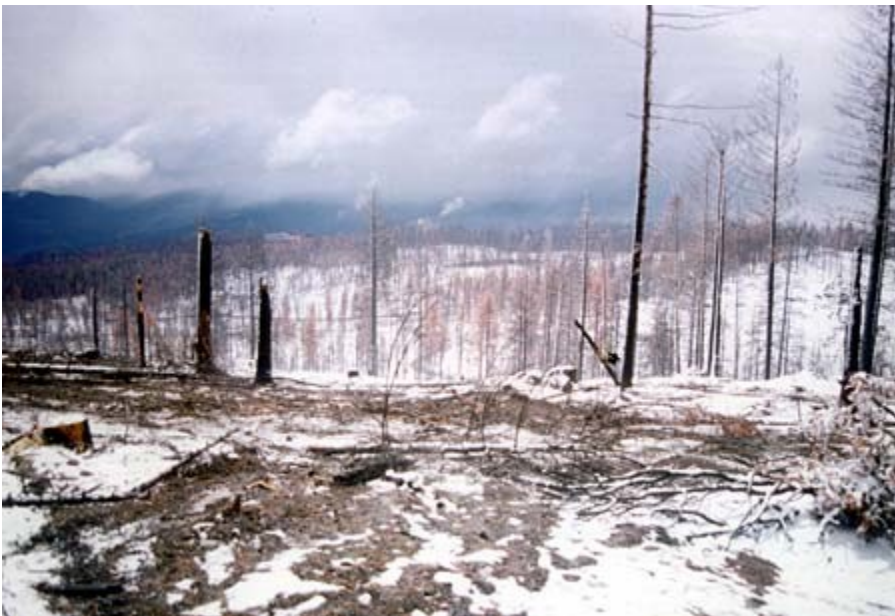
Summit Fire Site Covered in Snow

Salvaged logs from the 1996 Summit Fire site in the Malheur National Forest.