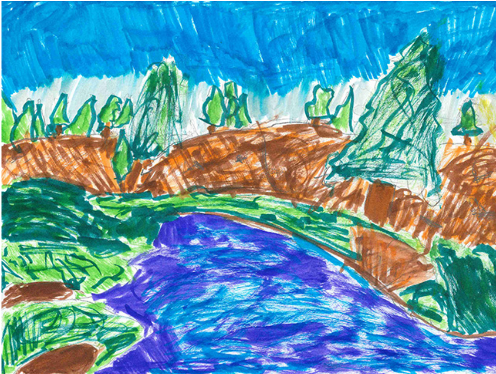
This impressionistic drawing by Luther Lawson shows the Deschutes River at Tumalo State Park.