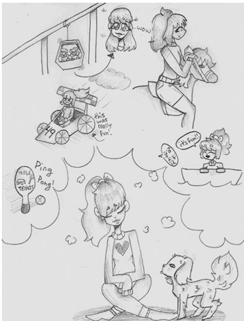
This drawing by Halle Krom depicts some of the fun things to do in the Wallowa Lake State Park area.