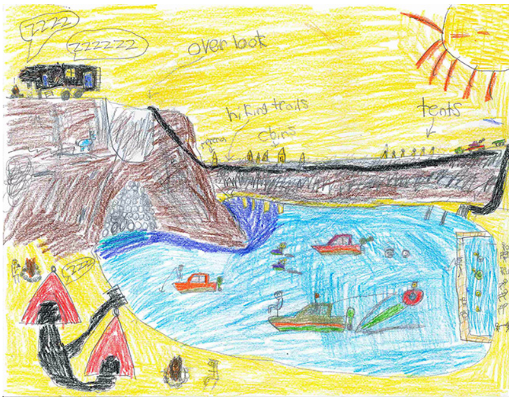
This drawing by Jacob Hurd shows camping, boating, and hiking at The Cove Palisades State Park.