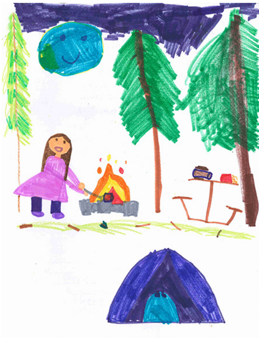
This drawing by Ivy Elseth shows a campsite at Harris Beach State Park.