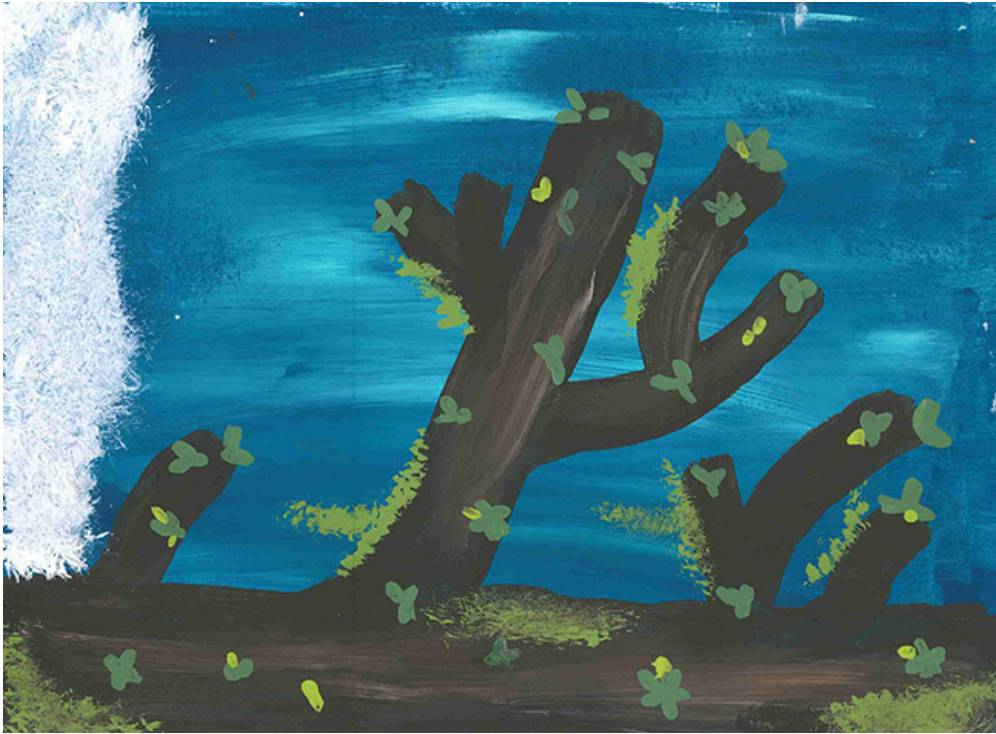
This drawing by Emma Arvin shows a downed tree at Silver Falls State Park.