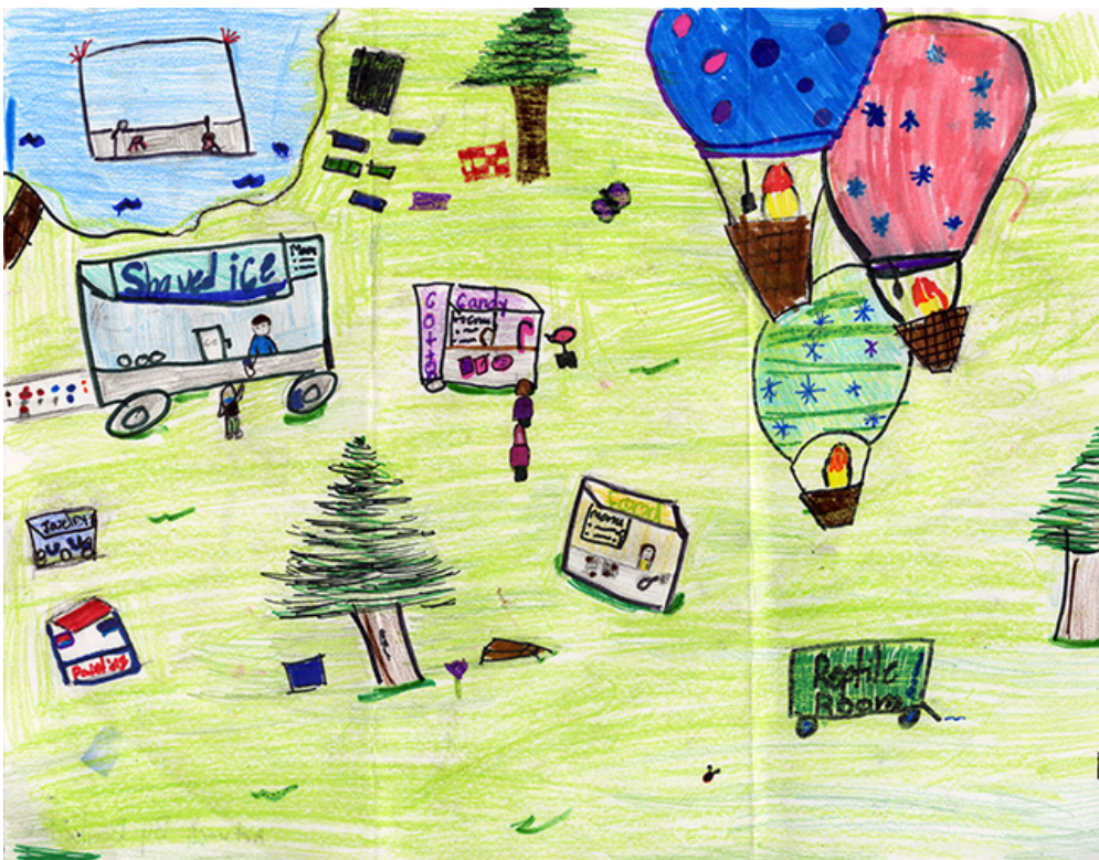
A drawing by Baylee Fox shows some of the features of the Albany Northwest Art and Air Festival, including hot air balloons, food and craft booths and a reptile room.