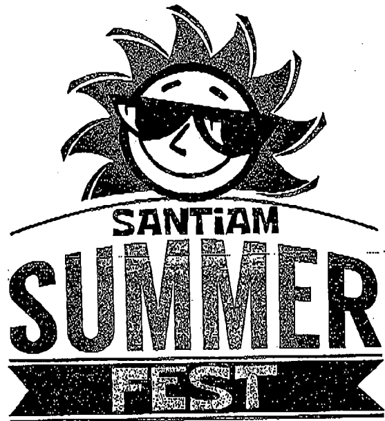
Updated Logo 2018

Updated complimentary colors beginning in 2018 to Teal & Red with the Orange Logo.