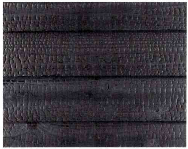
SUYAKI™ EXTERIOR BLACK Black, Dark

ALL | BLACK | BROWN | DARK | GRAY | LIGHT | MIDTONES | NATURAL