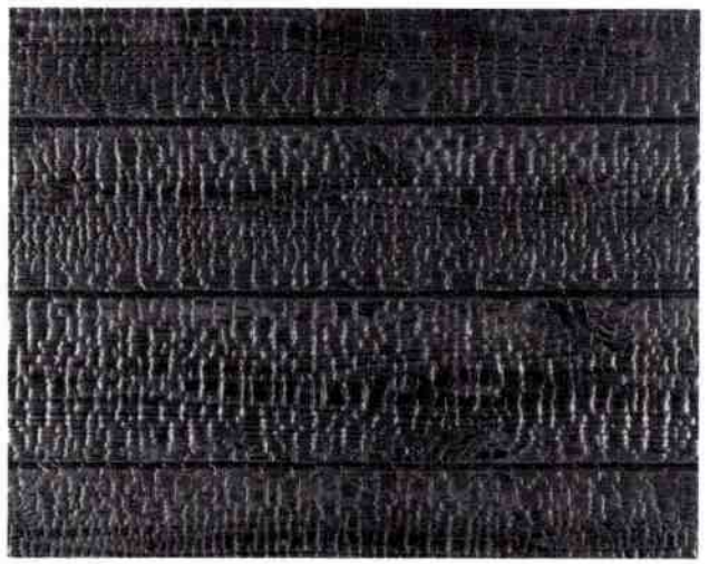
SUYAKI™ INTERIOR BLACK Black, Dark