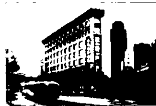
San Francisco Proper Hotel