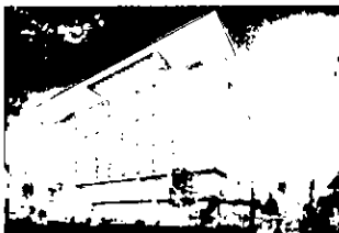
Portland Proper Hotel