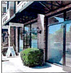
4 YOU & EYE Optometry and eyewear shop expands