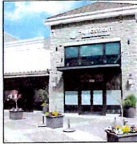
5 SUNDSTROM CLINICAL SERVICES Clinic can help improve parent-child relationships