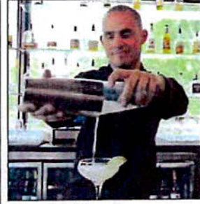
6 FIVE-O-THREE Enjoy special menus at the restaurant