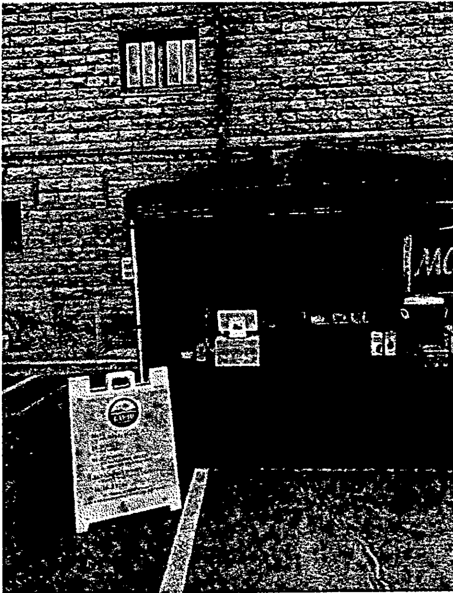
Exhibit A - Specimen